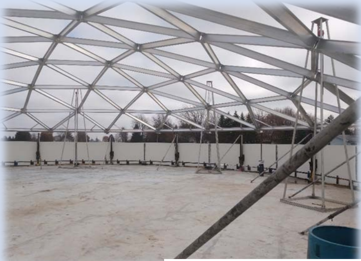
NEW 500,000 GALLON STORAGE TANK AT WILLIAMS TOWNSHIP PUMP STATION