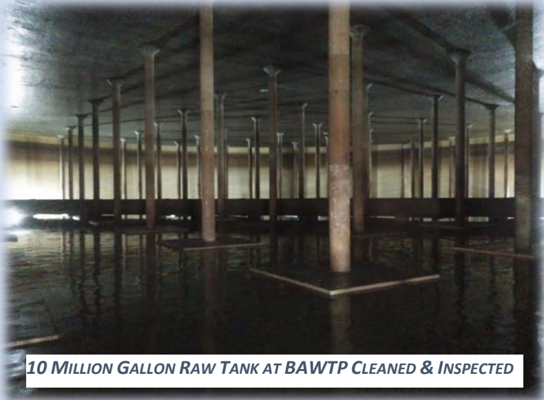
10 MILLION GALLON RAW TANK AT BAWTP CLEANED & INSPECTED