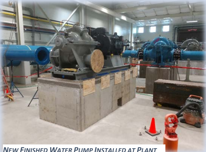
NEW FINISHED WATER PUMP INSTALLED AT PLANT