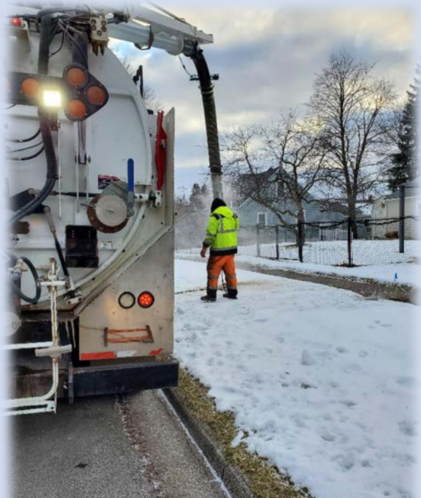
BAY CITY STAFF CHECKING MATERIAL OF SERVICE FOR DISTRIBUTION SERVICE INVENTORY