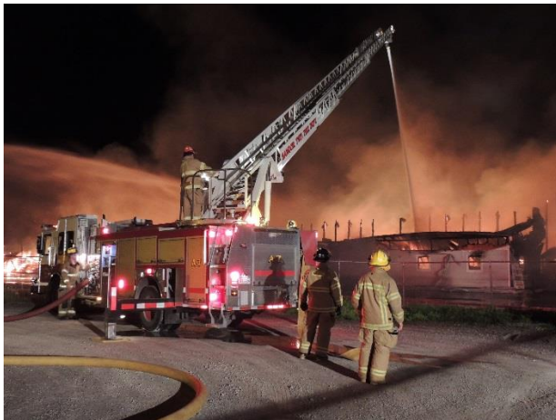
Monitor Lumber Yard Fire (FC's 2 nd Day)