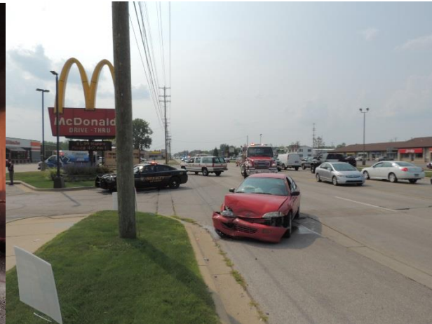
Motor Vehicle Accident on Wheel W/O State Park